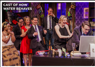
CAST OF HOW WATER BEHAVES

World Premiere “HOW WATER BEHAVES” by Sherry Kramer